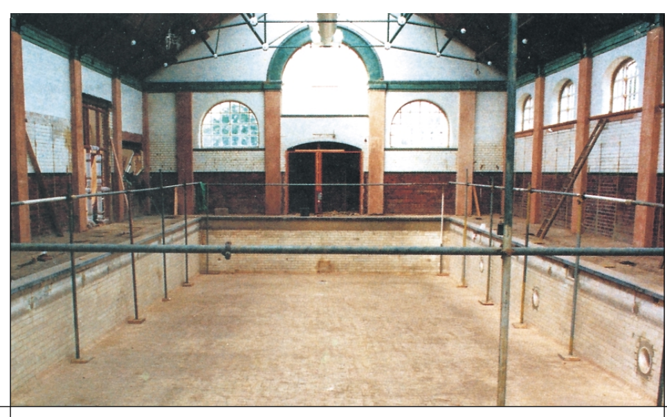
Alkorplan is the perfect way to renovate old leaking tiles or