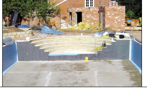
Complex shapes can be accommodated