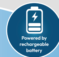
Powered by rechargeable battery