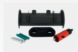
Cell installation kit for 50-mm and 63-mm hoses